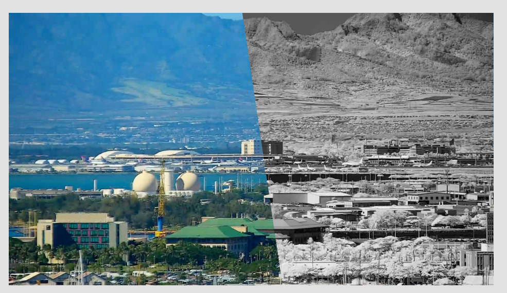
Standard Color Visible Image (Optical Fog Filter Disabled)

Infiniti's zoom cameras integrate the latest technology in realtime image processing such as WDR (Wide Dynamic Range), BLC (Backlight Compensation), HLC (Highlight Compensation), EIS (Electronic Image Stabilization), 3D DNR (Digital Noise Reduction), Digital Defog/Haze Reduction, etc. These allow users to achieve the best image quality possible in various applications with minimal operator intervention.